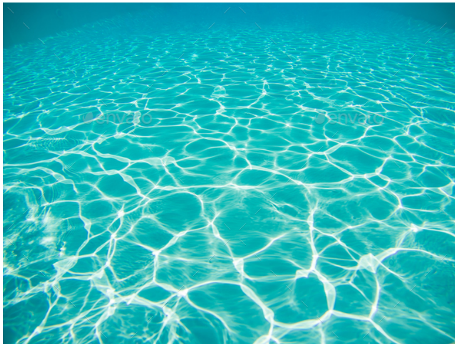
Figure 2: Picture of water caustics at the bottom of a swimming pool. 1

I thought of my own experience at a swimming pool late one night. It was half an hour from closing time when I started my swim. The floodlights and the water ripples were projecting undulating patterns of light on the pool bottom, called caustics , shown in Figure 2. There were still a good ten swimmers in the pool. As the minutes ticked away, they left one by one, until I was alone in the pool, when the whistle was blown to notify us that the swimming pool would be closing in ten minutes.